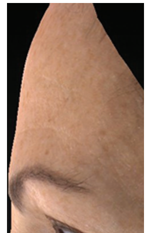
after 12 weeks of use of a O/W emulsion cont. 2% Volpura®